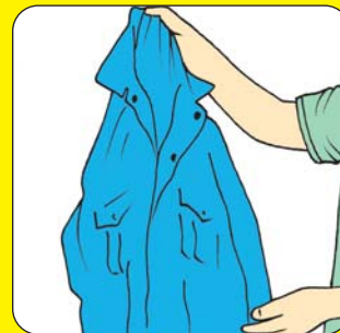
Handle dusty overalls with care