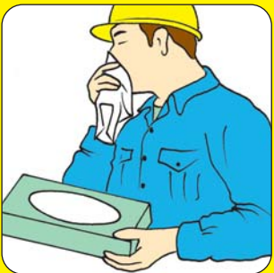
Use tissues rather than a handkerchief