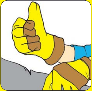
Wear gloves when handling lead