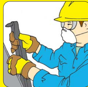
Wear a mask when welding