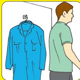
Remove work wear before leaving site