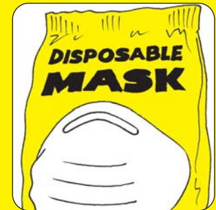
Make sure masks are clean. Check filters or use disposable masks