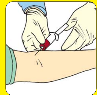
Ensure your blood lead levels are tested regularly