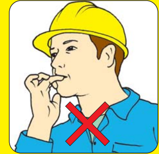
Don't bite your fingernails and keep them cut short