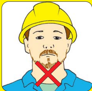
Beards can prevent masks sealing properly