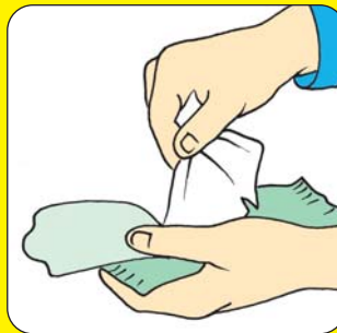
Use heavy duty hand wipes if running water is not available