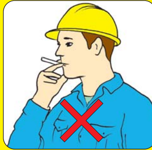
Don't smoke when working with lead