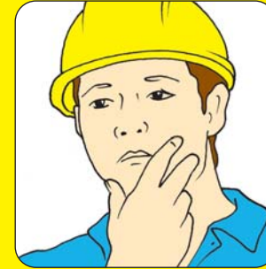
Keep your hands away from your face