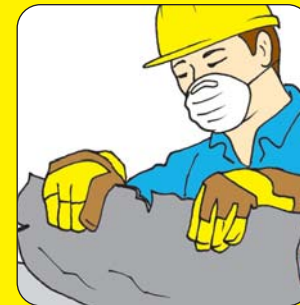
Wear a mask when stripping old lead