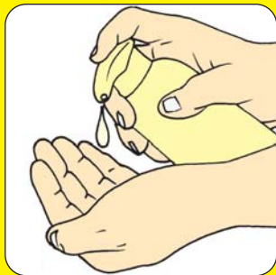
If possible, use a proper hand cleaner