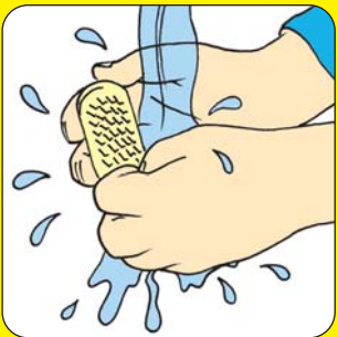
Scrub hands thoroughly when you finish work and before eating or smoking