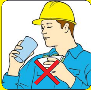
Don't eat or drink when working with lead